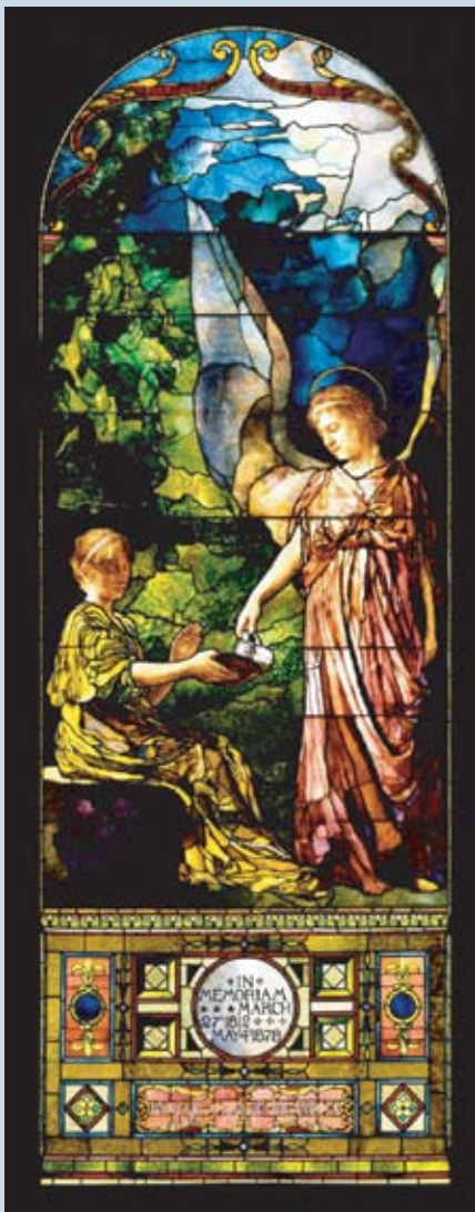
Helping Angel Window (detail), 1890 by John La Farge (1835-1910) Detroit Institute of Arts