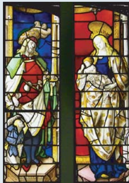
St. Wenceslas and the Virgin & Child Detroit Institute of Arts

www.americanglassguild.org/2010conference/2010overview.html