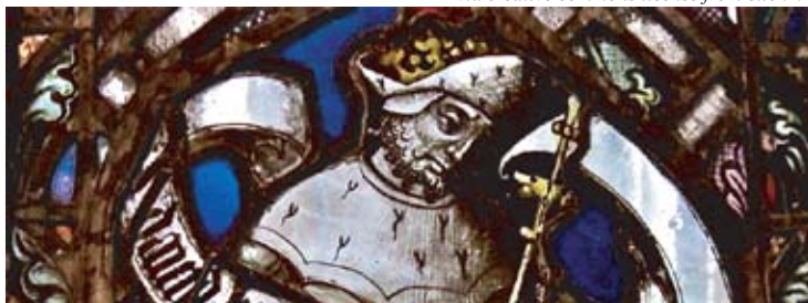
Detail of Window from the Gothic Chapel Detroit Institute of Arts