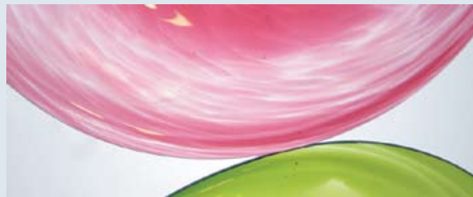
Rondels