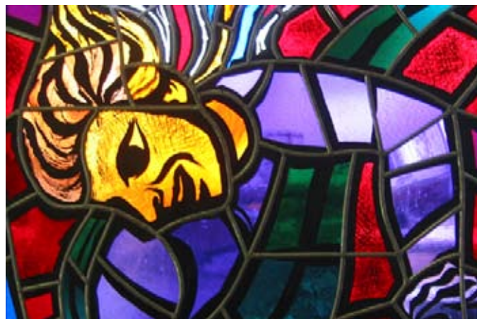
Isaiah Window (detail), Washington Cathedral, by Rowan LeCompte, 2010