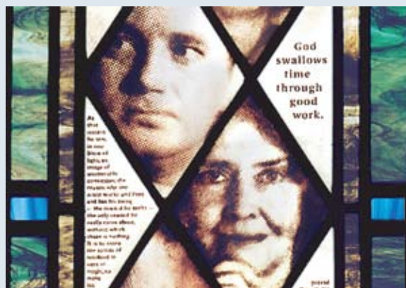
Asheville Authors (detail)